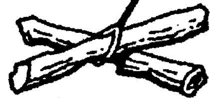
"Dead man" crossed sticks buried