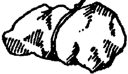
Rock buried in snow